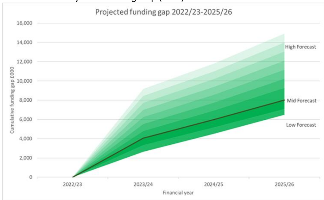
Chart Three – Projected Funding Gap (HRA)