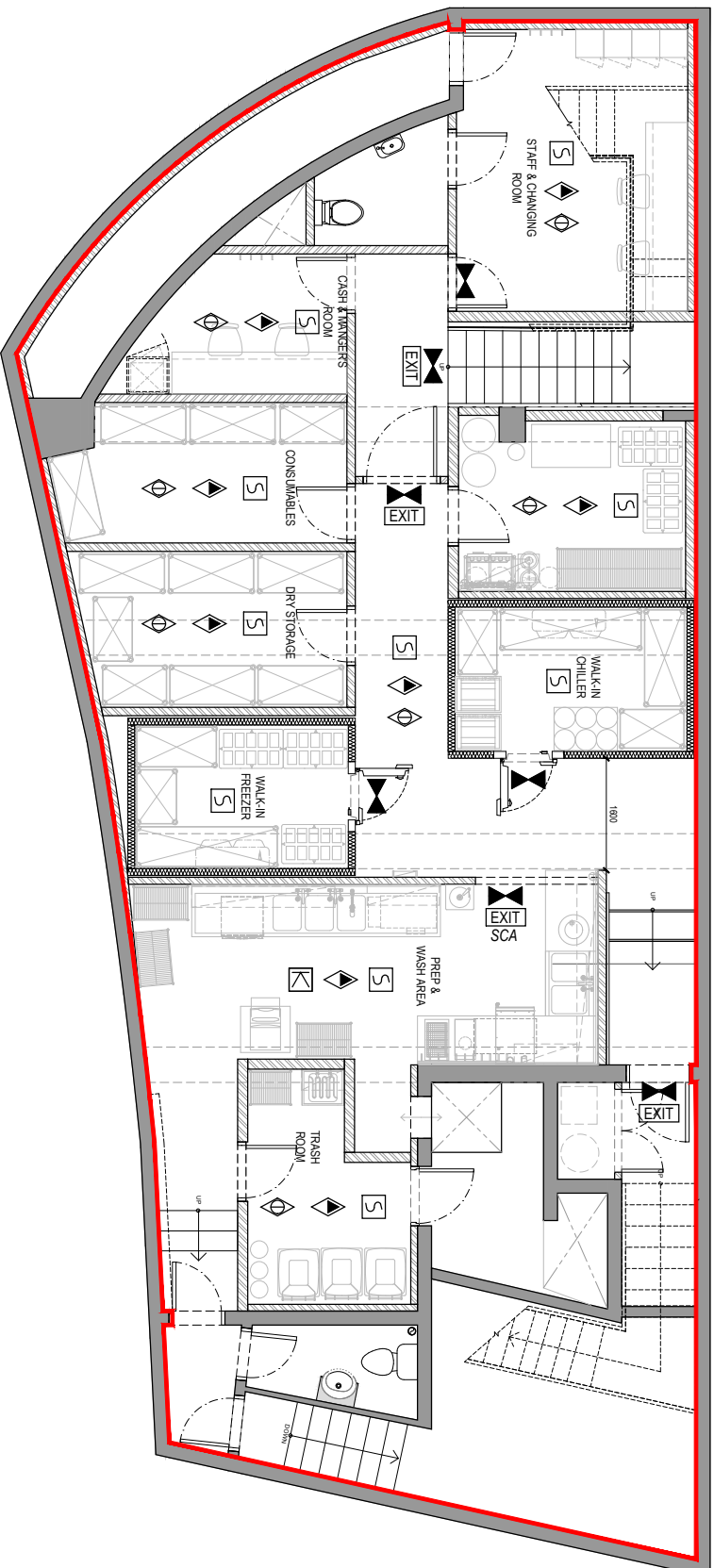
1 003 SCALE 1:50 BASEMENT LEVEL LICENSING PLAN