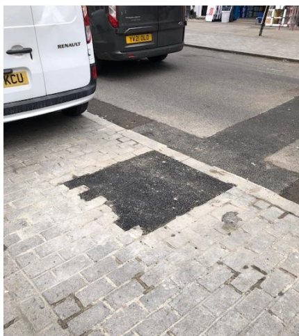
Setts replaced by tarmac concrete blocks