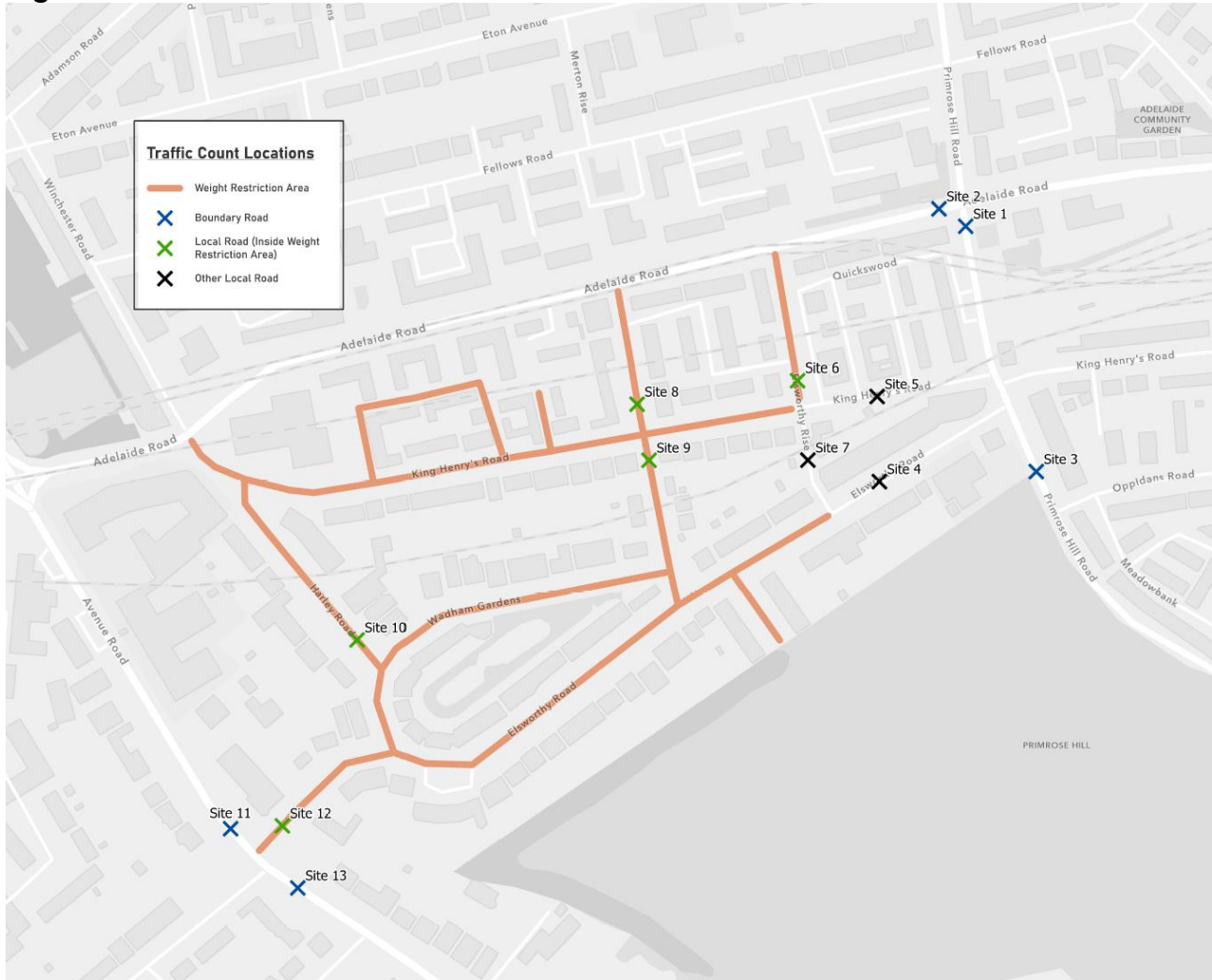
Figure 1: Traffic Count Locations